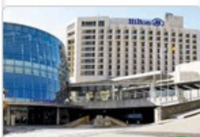
Grand Hilton Hotel